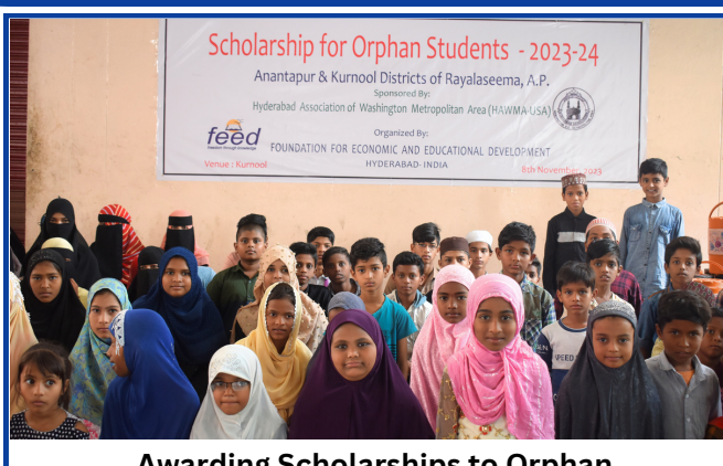
Awarding Scholarships to Orphan Students Sponsored By HAWMA - USA