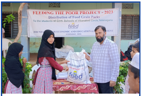
Distribution of Food Grain Packs to deserving Students