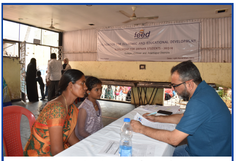
Interviewing Students for Orphan Scholarships